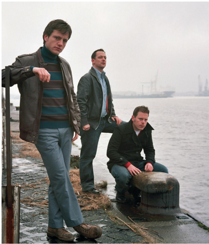
Hip-Hoppers from Hamburg with their own independent label: the band "Fettes Brot!"

Almost a dozen companies line up to create Hamburg's subculture vibrations. Hamburg has always been a talent factory for creative musicians: Udo Lindenberg, Fünf Sterne Deluxe, Fettes Brot, Lotto King Karl, Stefan Gwildis as well as Echo laureate Annett Louisan started their career in Hamburg. The German Rock and Pop Award is presented in Hamburg since 2000 and constitutes an important competitive event for young talents.