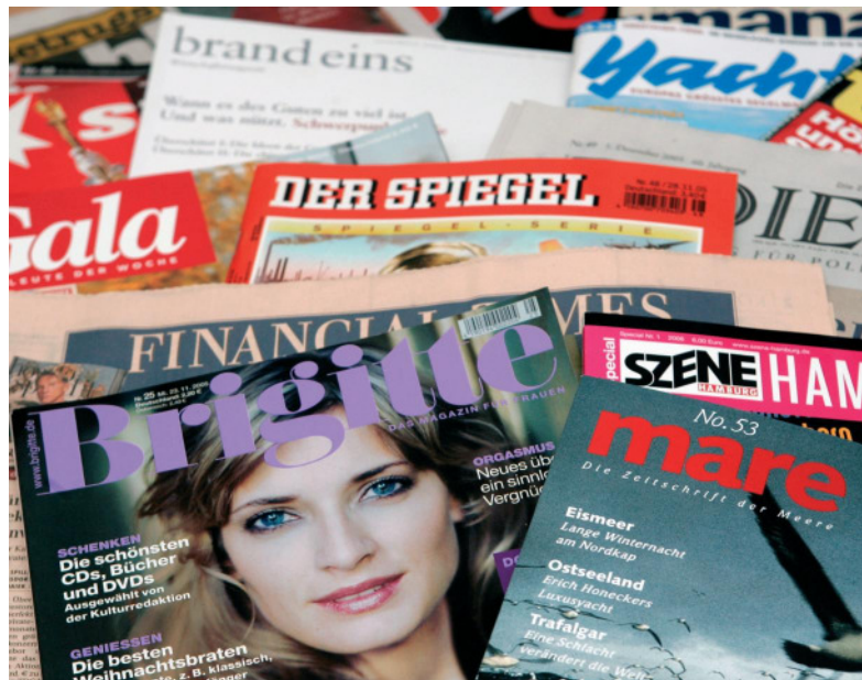
Media variety "Made in Hamburg".

Publishing has had a very long tradition in Hamburg. As early as in 1830, Hamburg was known as "Germany's stronghold of news-