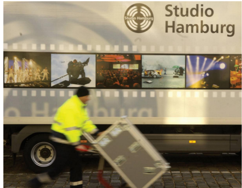
Every viewer has already seen Studio Hamburg TV productions.

With Norddeutscher Rundfunk (NDR), Hamburg hosts the third largest ARD public broadcasting station. ARD has been broadcasting its daily news "Tagesschau" from Hamburg for 50 years, regional broadcastings are produced by the local studios of ZDF, RTL and SAT1. The Media Centre Rotherbaum was founded in 1995 and meanwhile has become home base of Germany's most successful local TV station, Hamburg 1. The same building accommodates the ZDF talk show "Johannes B. Kerner".