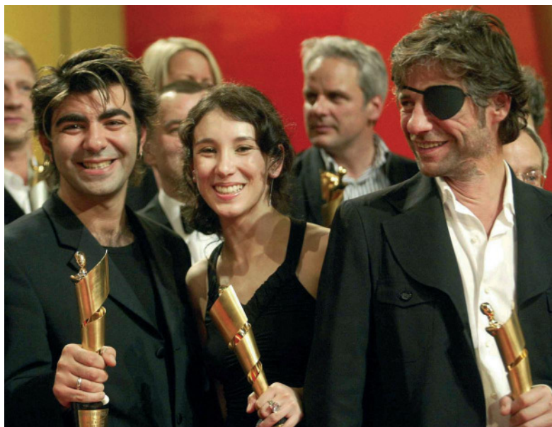
Film maker Fatih Akin and his leading actors Sibel Kekilli and Birol Ünel (from left) won as much as three German film prizes for Hamburg with the film "Gegen die Wand (Head on)".

The industry network Hamburg@work offers a platform for cross-linking suppliers from the IT industry and the digital communication sector. Further information on multimedia and IT is available in our Sector Profile "Hamburg –Major IT Centre".